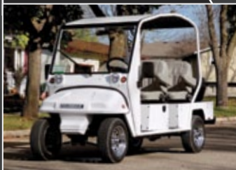
SUMMIT-4 LSV AC