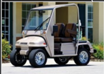
SUMMIT-2 LSV AC